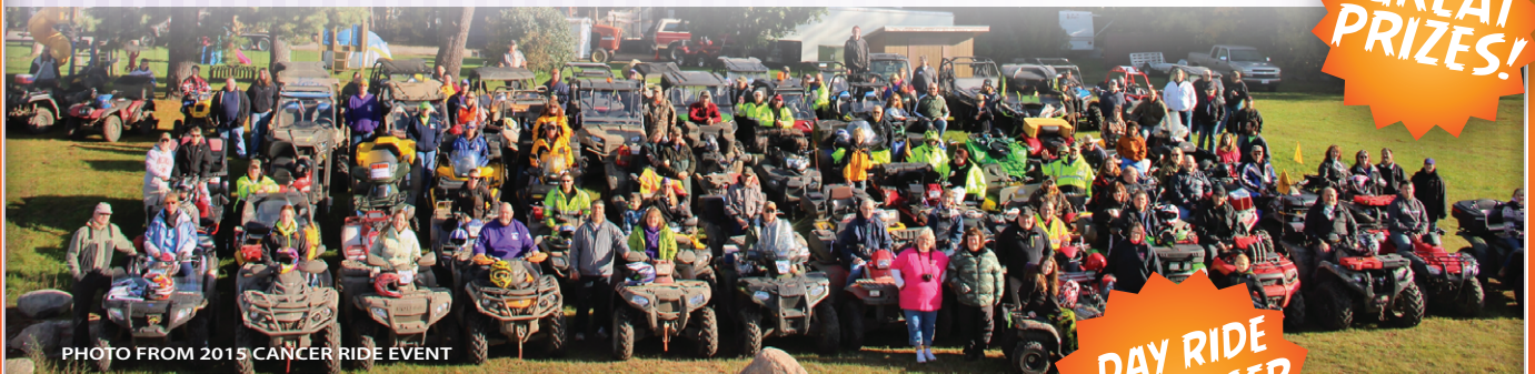
PHOTO FROM 2015 CANCER RIDE EVENT

A KETTLE MORAINÉ ATV ASSOCIATION EVENT ON THE DUSTY TRAIL ATV TRAIL SYSTEM